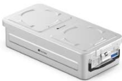
With Safety Lid