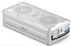
With Perforated Lid